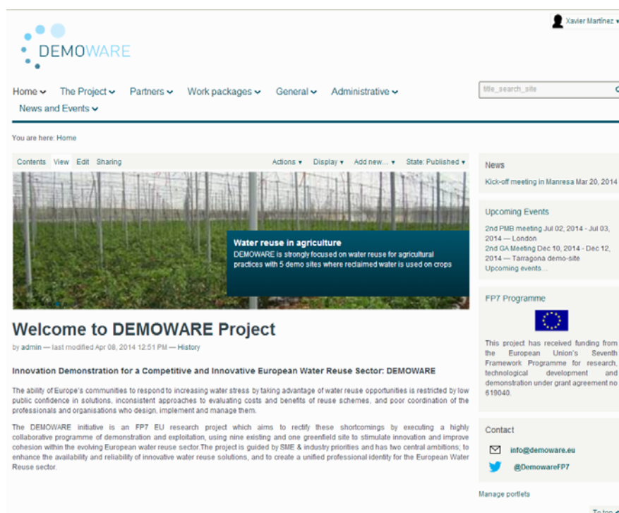
Figure 4 Home page view for a registered user

Finally, all the project members are admitted to the Administrative section with legal documentation such as the Grant Agreement and its annexes, guides and templates for project reporting and audit certifications and a summary of the Demoware Budget of each partner.