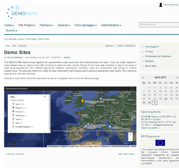
Figure 3 Map of demonstration sites

The Project subsection includes more details about the project concept, challenges and objectives, structure and demo sites. In order to show DEMOWARE extension all over Europe, demo sites are presented in an interactive map which let the user choose among all the sites of the project and access to more information from each one (Figure 3).