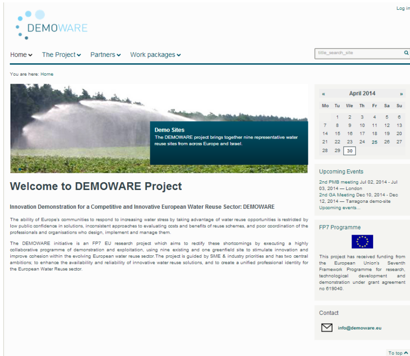
Figure 2 Home page of DEMOWARE website

The Project subsection includes more details about the project concept, challenges and objectives, structure and demo sites. In order to show DEMOWARE extension all over Europe, demo sites are presented in an interactive map which let the user choose among all the sites of the project and access to more information from each one (Figure 3).